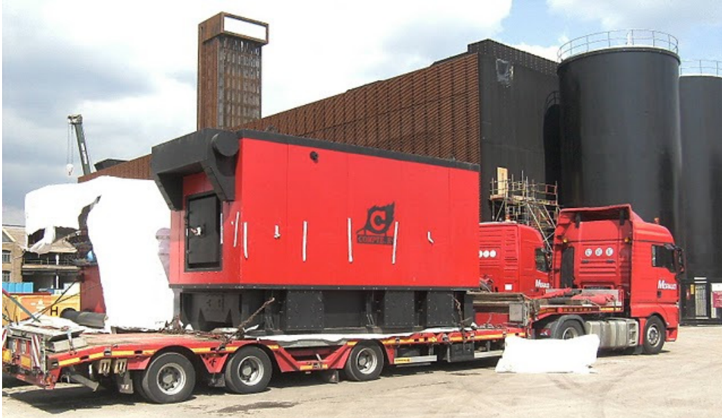
Delivery of Compte-R woodchip boiler for London Olympic Park

Clearpower was selected by competitive tender to be the supplier of the biomass heating equipment to the 2012 Olympic Park at Stratford. Heating at the Olympic Park is provided via a District Heating network. This District Heating network provides heating to the apartments within the athlete's village (now known as East Village residential development) as well as other major buildings on the site including the media centre and velodrome.